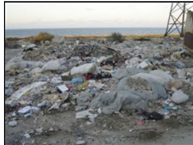
Garbage on Sumgayit's seashore (RFE/RL)

SUMGAYIT, September 18, 2007 (RFE/RL) -- On a slight incline, overgrown with grass and weeds, the graves -- some of them a simple headstone, others fenced-off and garnished with flowers -- seem to face away from the chimneys on the horizon.