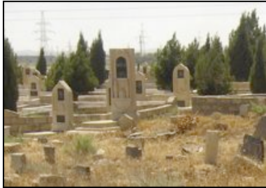
Children's graveyard in Sumgayit