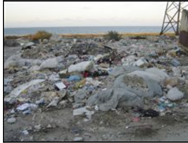
Garbage on Sumgayit's seashore (RFE/RL)

SUMGAYIT, September 18, 2007 (RFE/RL) -- On a slight incline, overgrown with grass and weeds, the graves -- some of them a simple headstone, others fenced-off and garnished with flowers -- seem to face away from the chimneys on the horizon.