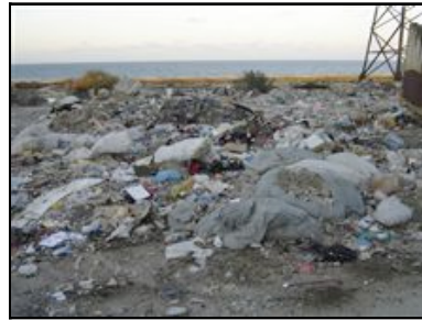
Garbage on Sumgayit's seashore (RFE/RL)

SUMGAYIT, September 18, 2007 (RFE/RL) -- On a slight incline, overgrown with grass and weeds, the graves -- some of them a simple headstone, others fenced-off and garnished with flowers -- seem to face away from the chimneys on the horizon.