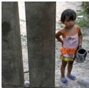
In Pictures: The World's 25 Dirtiest Cities

Unless you're in the oil business, there's little reason to brave the choking pollution of Baku, Azerbaijan. Fetid water, oil ponds and life-threatening levels of air pollution emitted from drilling and shipping land the former Soviet manufacturing center at the bottom of this year's list as the world's dirtiest city.