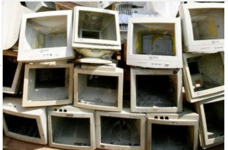
IMAGE: FILE PHOTO: AGBOGBLOSHIE, A PROCESSING SITE FOR E-WASTE IN ACCRA, GHANA HAS MADE IT INTO A TOP TEN OF THE WORLD'S MOST POLLUTED PLACES.

The 2013 report is the eighth in an annual series of reports.