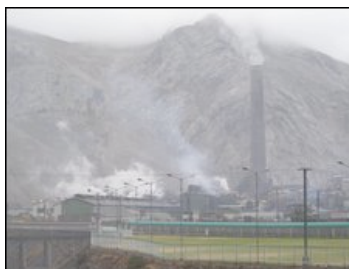
The smelter in La Oroya is one of the 10 most polluted places on earth.

But in the town of La Oroya, some 3,700 metres above the sea, a multi-metal smelter spews out thick fumes that irritate the throat and eyes.