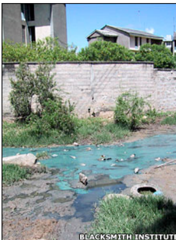
Industries such as tanning can leave their trace in water

In the slums of many developing world cities, you find water of hues that water does not naturally assume - blues, yellows, purples and greens that speak of industrial outflows not very far upstream.