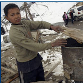
In Pictures: World's Dirtiest Cities

The world has to face the fact that dirt costs, and dirty cities cost big time. Today over half the world lives in urban as opposed to rural environments. This means ever more concentrated dirt.